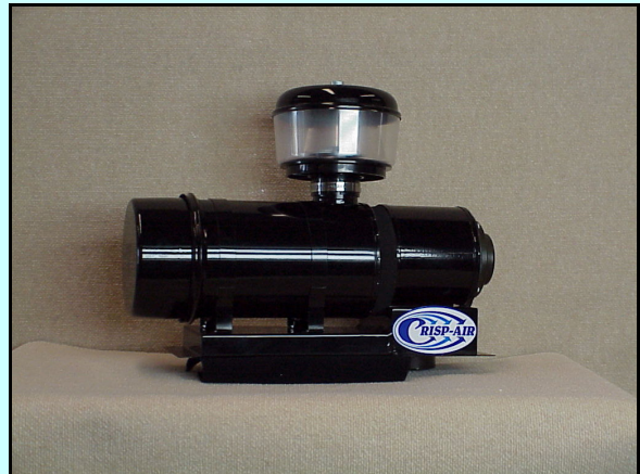
Pressuriser Assembly (460L x 330H x 200W) A fan forced precleaner and filter assembly. Gives a positive pressure to a well sealed cabin.