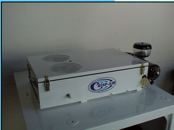
Model CR7 (974L x 610W) Roof mounted self contained air conditioning unit. Aside from the compressor, all components are enclosed in the roof mounted case. (Heating and Pressurisation as shown are optional)